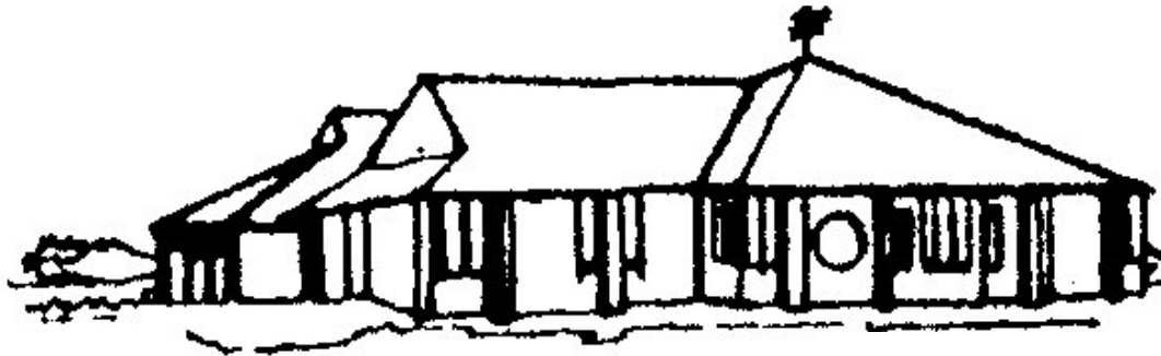
St Colman's Kilroot